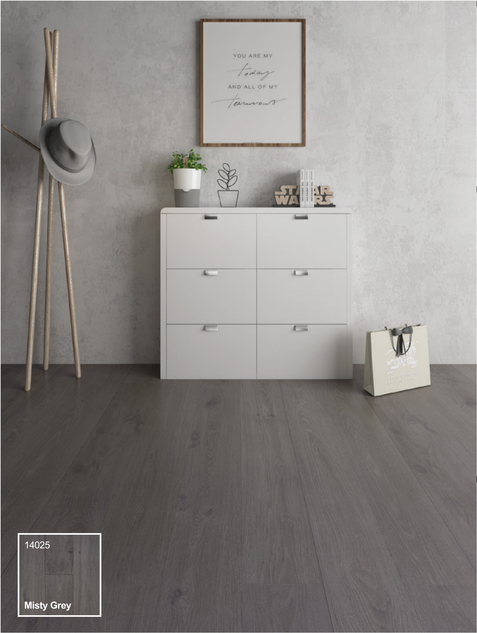
14025 Misty Grey