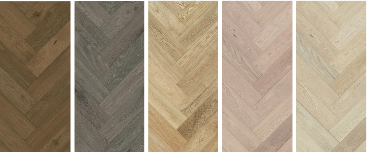
Coral Sand Moss Grey Oak Natural Oak Blanc Oak Pure 1051 Brushed Lacquer Surface 1062 Brushed Lacquer Surface 3001 Brushed Lacquer Surface 3003 Brushed Lacquer Surface 3005 Brushed Lacquer Surface