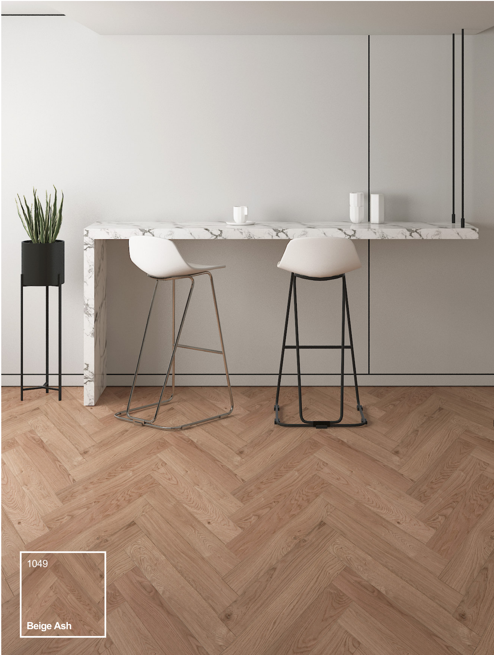
1049 Beige Ash