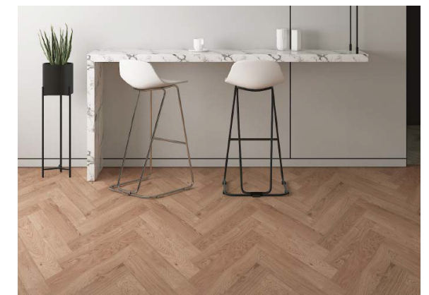
Herringbone - Oak Flooring ————— 9