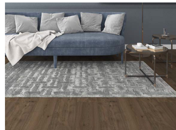
20mm - Oak Flooring ————— 7