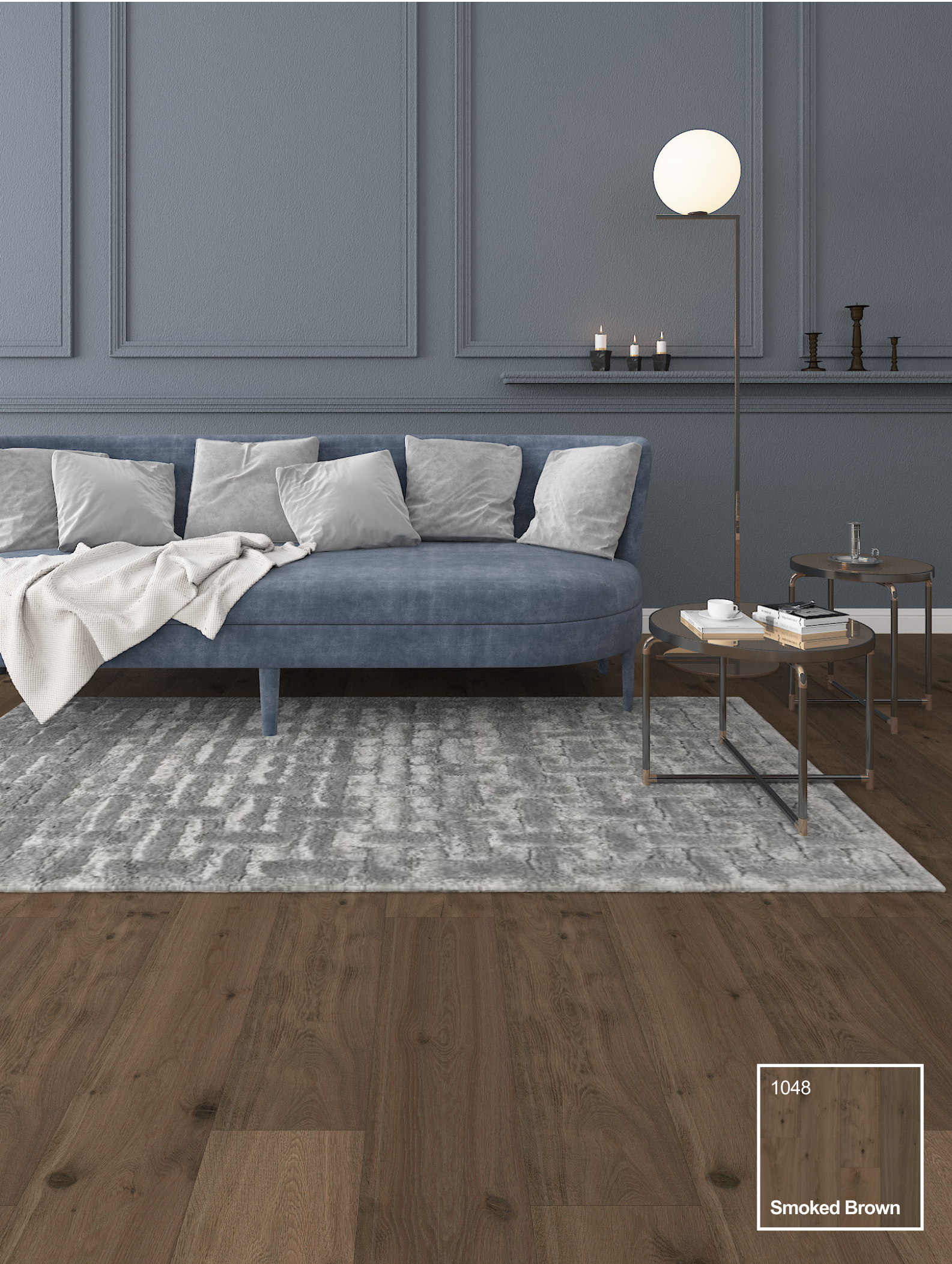
1048 Smoked Brown