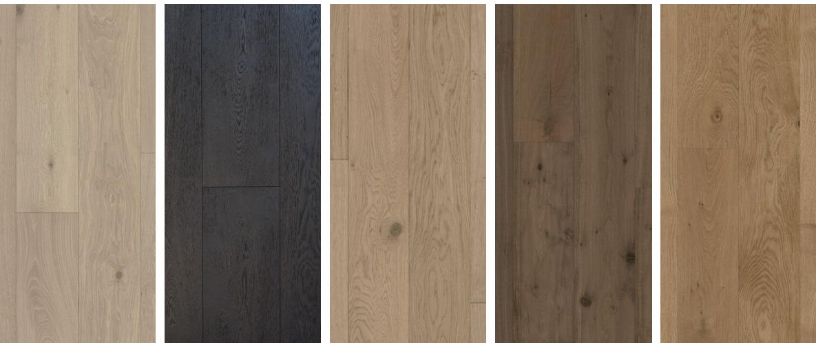
Natural Limed Oak Ebony Raw Neutral Smoked Brown Beige Ash 1002 Brushed Lacquer Surface 1022 Brushed Lacquer Surface 1043 Brushed Lacquer Surface 1048 Brushed Lacquer Surface 1049 Brushed Lacquer Surface