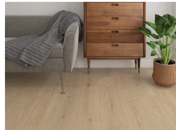
14mm - Oak Flooring ————— 3