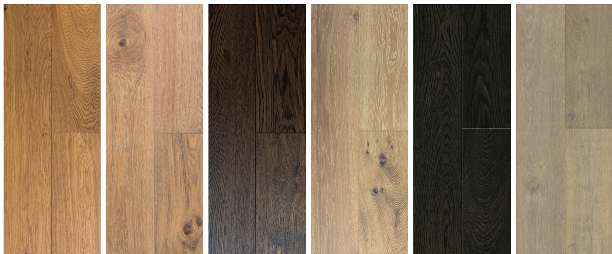
Oak Latte Classic Oak Walnut Lime Wash Black Forest Crayon

14021 14022 14023 14024 14025 14026 Brushed Lacquer Surface Brushed Lacquer Surface Brushed Lacquer Surface Brushed Lacquer Surface Brushed Lacquer Surface Brushed Lacquer Surface