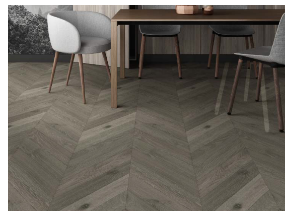
Chevron - Oak Flooring ————— 11