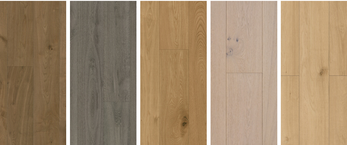
Coral Sand Moss Grey Oak Natural Oak Blanc Oak Pure 1051 Brushed Lacquer Surface 1062 Brushed Lacquer Surface 3001 Brushed Lacquer Surface 3003 Brushed Lacquer Surface 3005 Brushed Lacquer Surface