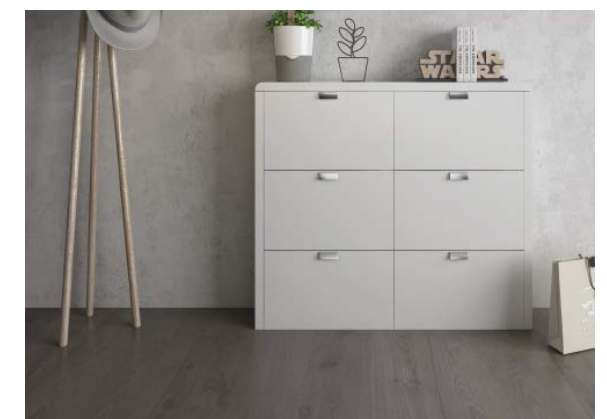
Maintenance, Facts, and Warranty — 13