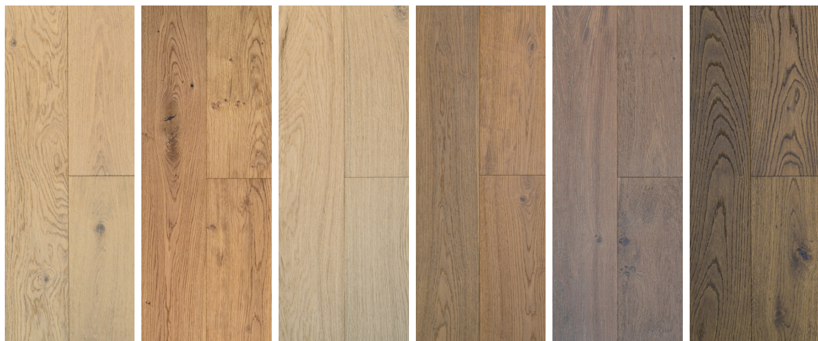
Cream White Light Tan Vintage Natural Honey Brown Misty Grey Noble Grey

14021 14022 14023 14024 14025 14026 Brushed Lacquer Surface Brushed Lacquer Surface Brushed Lacquer Surface Brushed Lacquer Surface Brushed Lacquer Surface Brushed Lacquer Surface