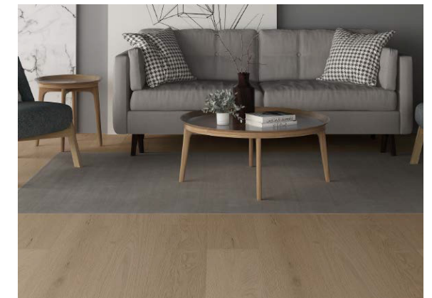
15mm - Oak Flooring ————— 5