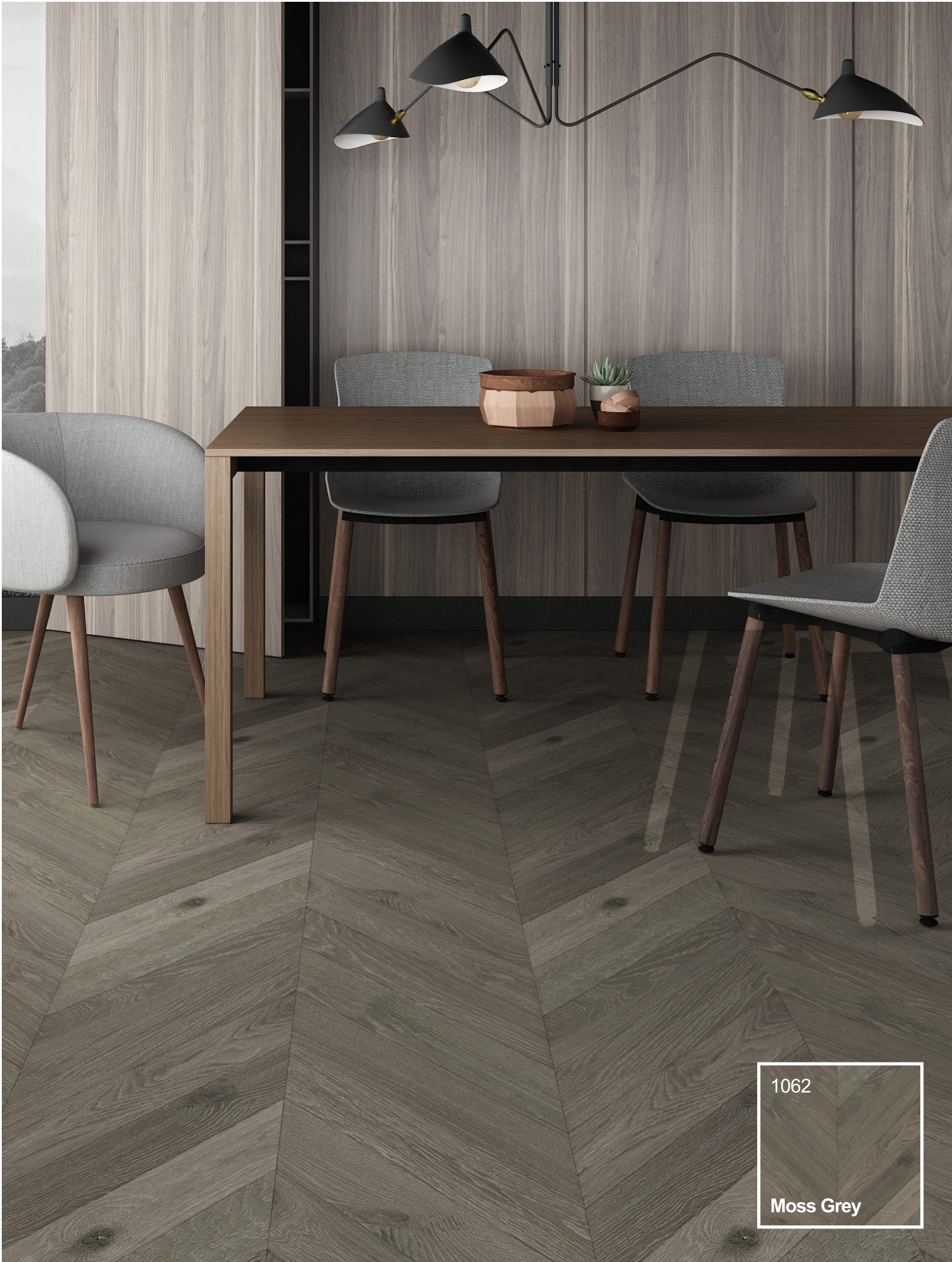
1062 Moss Grey